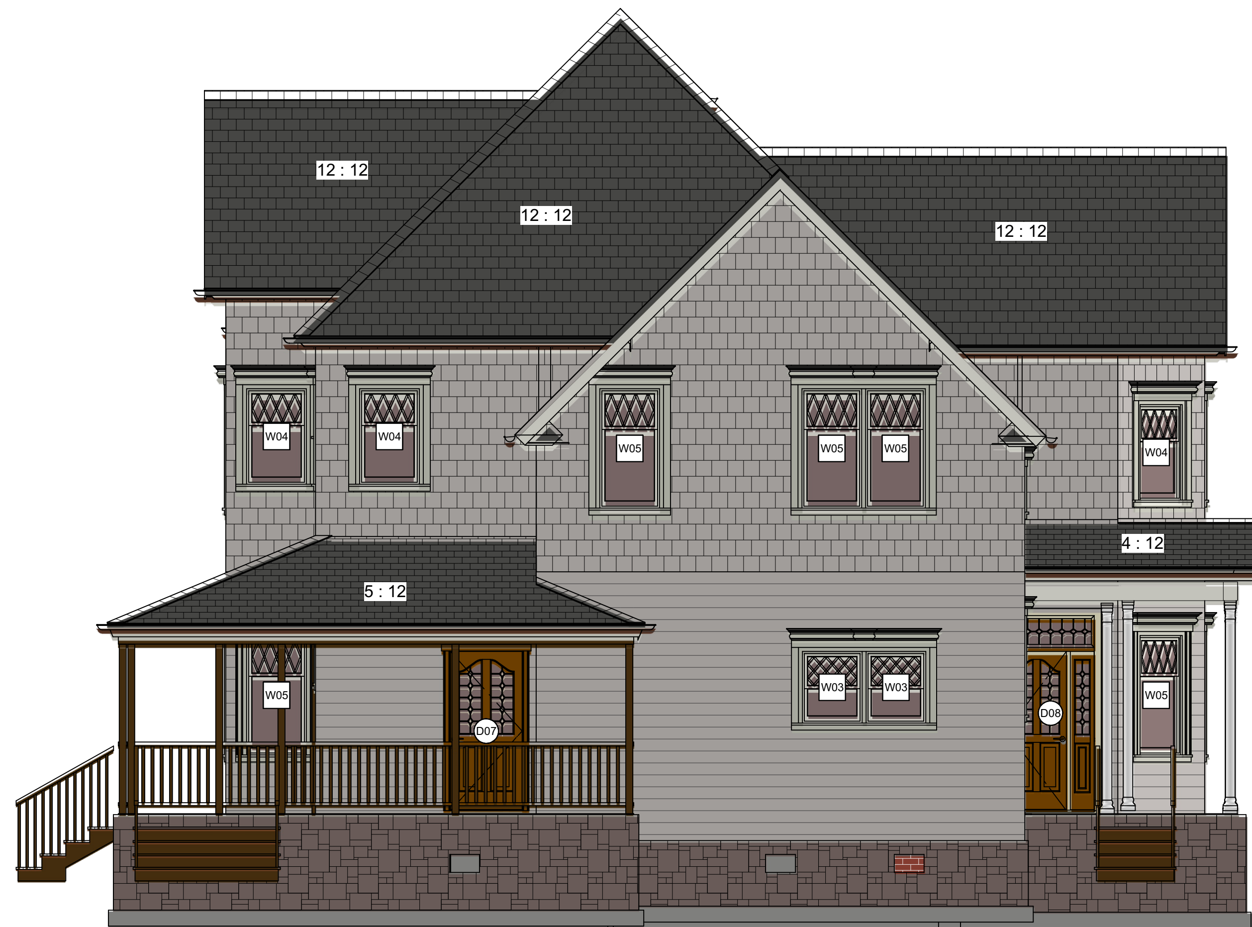
L SIDE LEFT ELEVATION A-03 SCALE = 1/4 in = 1 ft