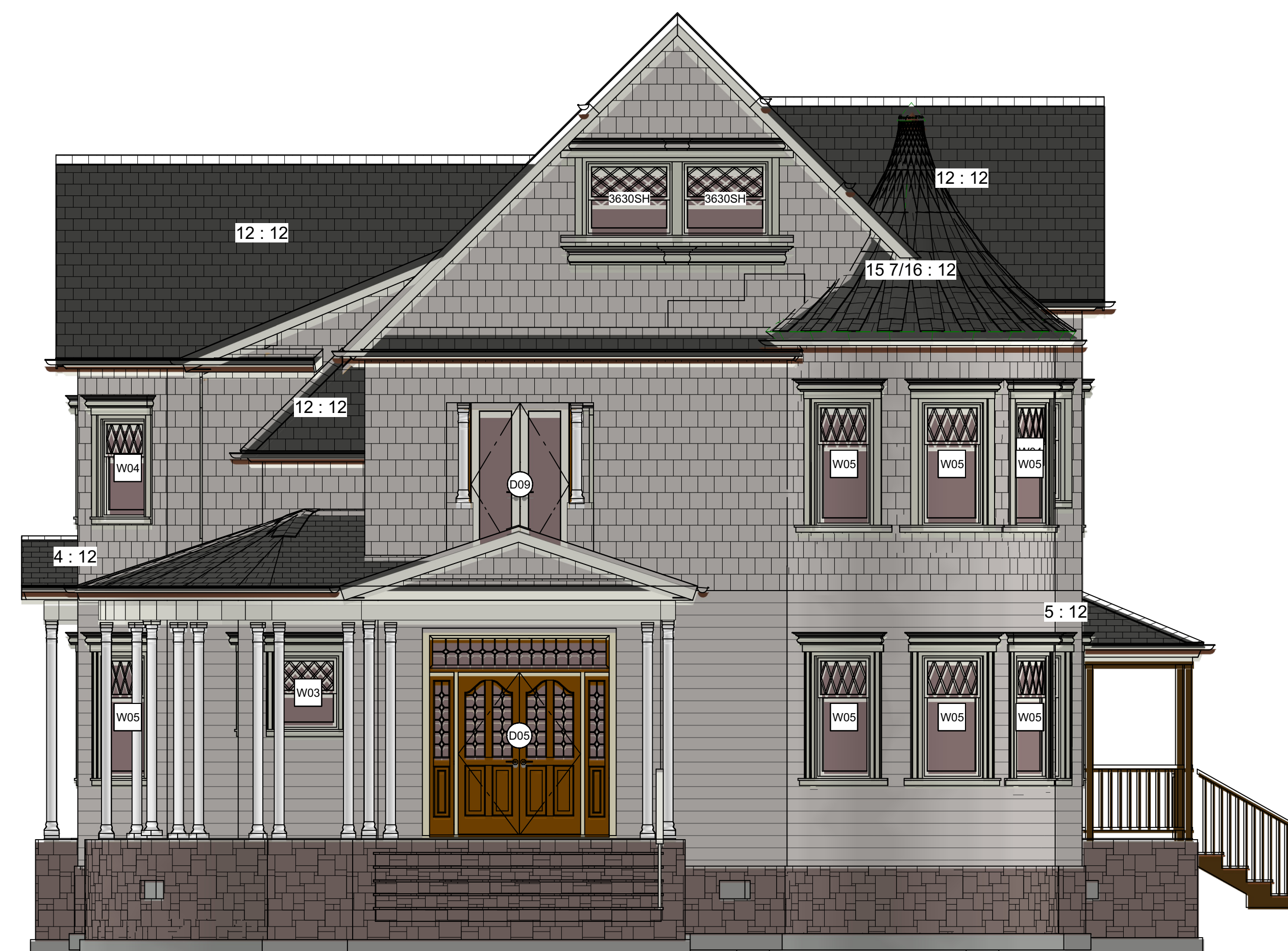
R SIDE RIGHT ELEVATION A-03 SCALE = 1/4 in = 1 ft