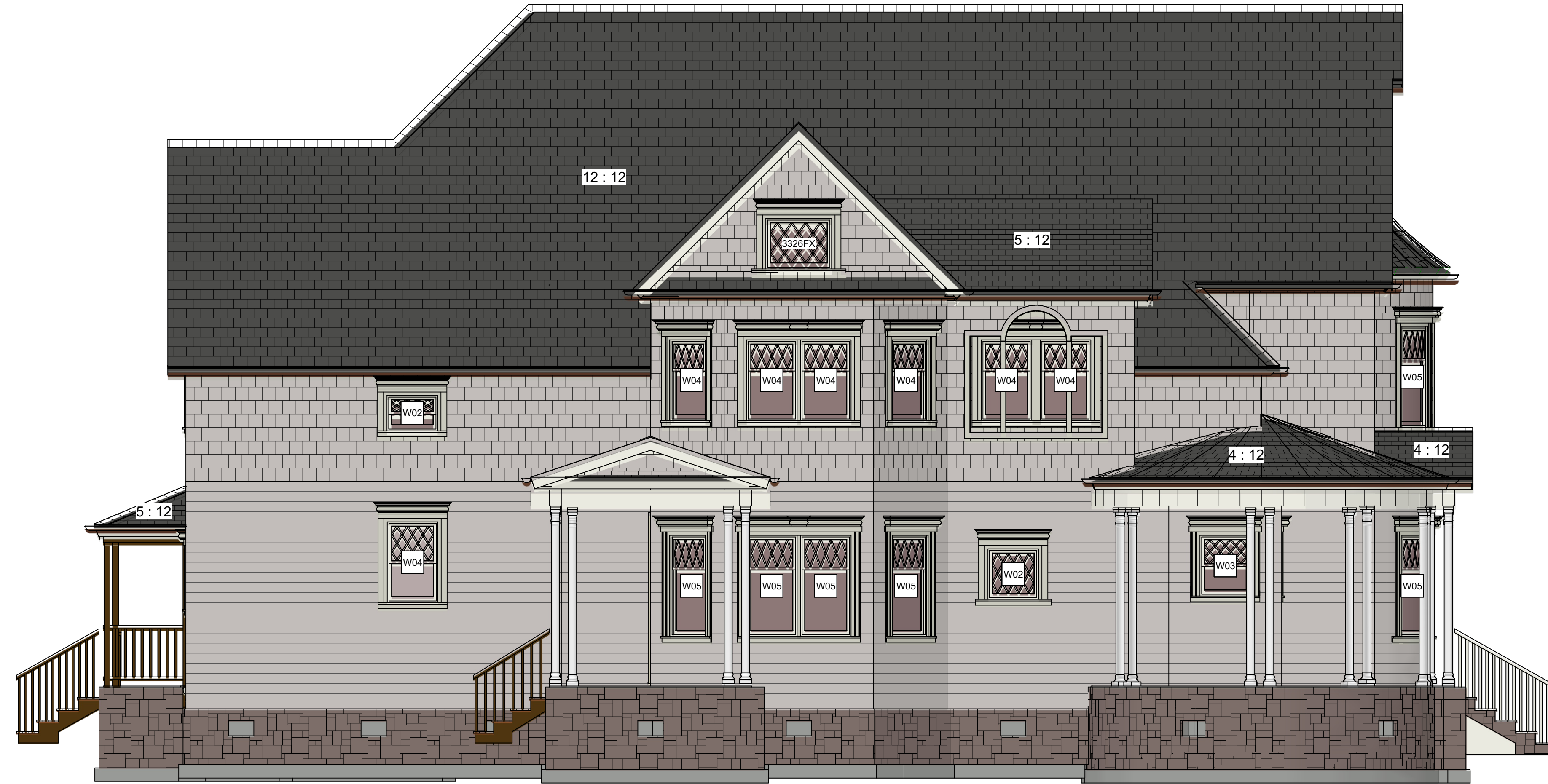
F FRONT ELEVATION A-03 SCALE = 1/4 in = 1 ft